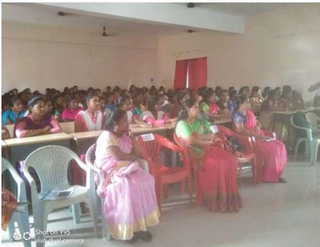
Participants of Guest Lecture on 29.10.2019