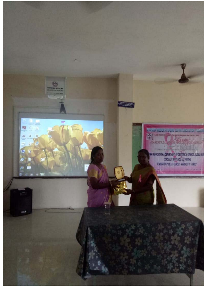
Honoring the Speakers